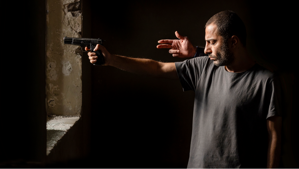
Beyond the Wall de Vahid Jalilvand